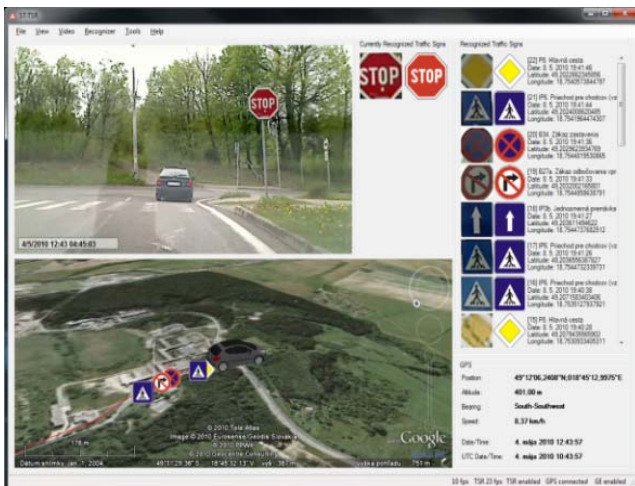
Fig. 5 Main screen of the application for collecting traffic signs

Moreover, the application can be used to load stored traffic signs and train/test developed TSR algorithm, annotating traffic signs from still images and videos (determination name of traffic signs), viewing and editing.