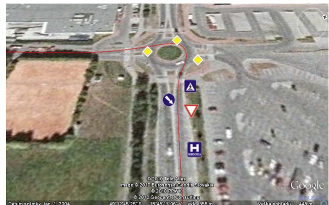
Fig. 4 Recognized traffic signs showed alongside red line (GPS track) on the map

the left or right side of the road. To simplify the operating system, the signs located straight above the road were not taken into consideration in the current system. We have determined the value of both constants to 0.00005 in decimal degrees by performed experiments.