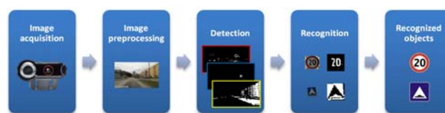
Fig. 1 Procedure of traffic sign recognition

The next step after the image has been acquired is the image preprocessing phase . To put it in other words, the image file is prepared to the detection stage, e.g. the system removes the noise from the image file. This process is objectively necessary when the video source contains the compression artefacts. In this stage, we chose to use a smoothing filter such as a Gaussian filter.