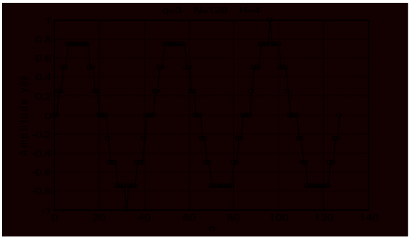
Fig.1 Sinusoidal signal quantized in the amplitude (q=3)