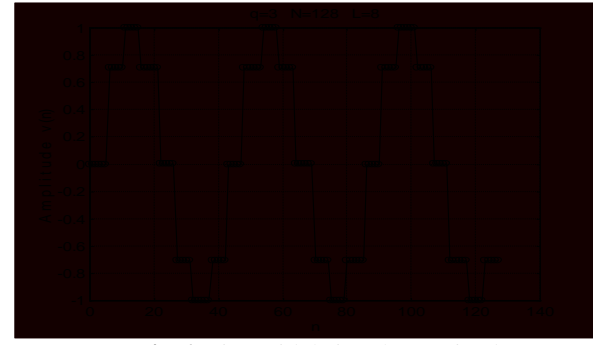
Fig.6 Sinusoidal signal quantized in the phase (q=3)

Fig.6 demonstrates the effect of index transform s(n) into v(n) and Fig.7 that of the inverse transform S(k) into V(k).